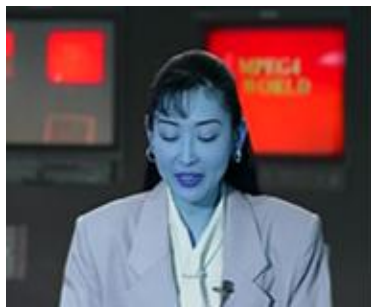
Fig.2. PSNR = 11.8345

In this, we will show some experimental results. The image database used in the experiment is from LIVE, which consists of original high-resolution YUV format video files. It includes different distortion types of video sets. The detail of the video PSNR values are shown. We only use the total of 2 distorted video files in our experiment.