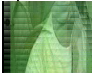
Fig.5. PSNR = 1.2104