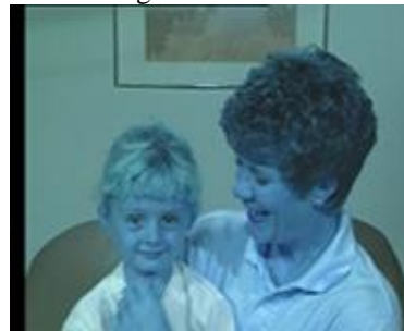
Fig.4. PSNR = 18.8015